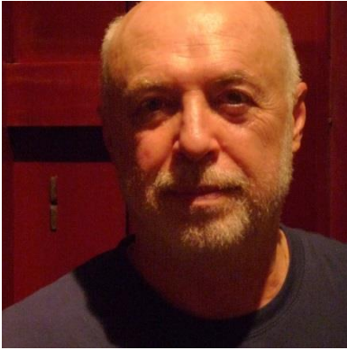
Jurij Alschitz Germany