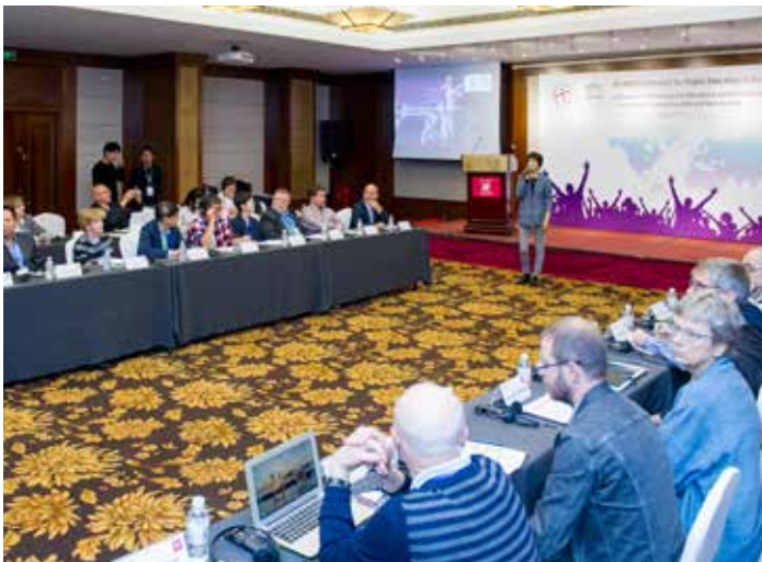
Conference: 1 st day meeting

To facilitate this, a number of socially oriented events were held, such as a speed dating session. Furthermore, each of the 34 universities were asked to give an introductory presentation of their university, allowing for everyone to fully grasp the wide array of universities and institutions whom were in Shanghai for the event.