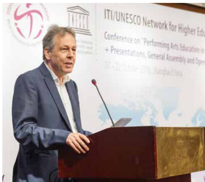
President of the ITI/UNESCO Network