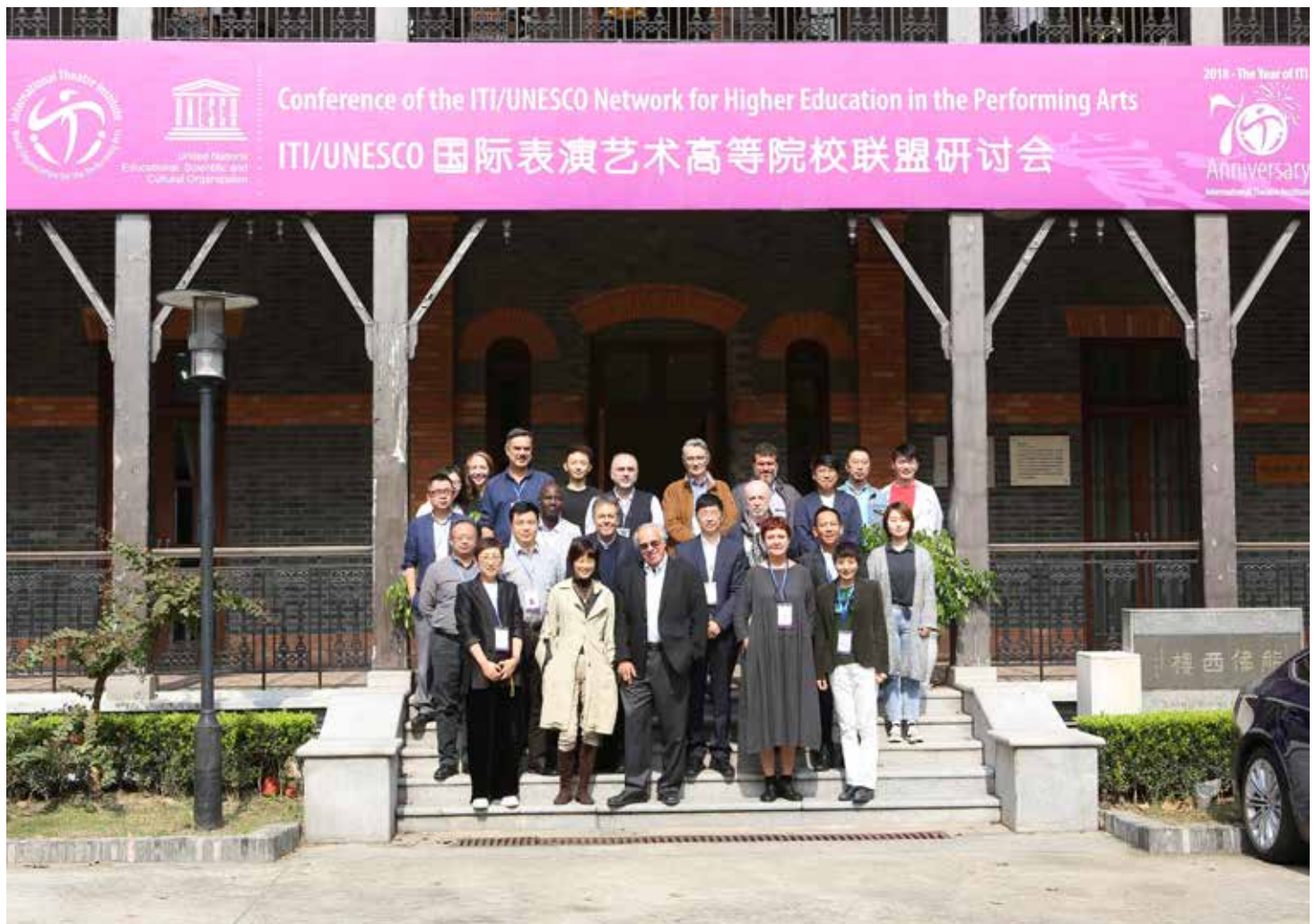
The participants of the "Prologue" of the 6-day event.

Both of these were highlighted as key issues for the Network in the past. In order to more effectively facilitate exchange of methods, personnel and students across the globe, it is highly important that universities know the standards, curriculums, and practises of what goes on in other countries, so that a general understanding, and equal platform, can be created. Secondly, a pressing matter for performing arts universities and institutions is how they are assessed by state and private evaluation and ranking systems, which often have an impact on the funding they receive. Currently performing arts faculties are assessed on standards created for science and traditional studies – and suffer under this one size fits all approach. As such it was important for the Network to act as a platform which would open up a dialogue on this issue, and allow for an exchange of experiences and methods when dealing with it.