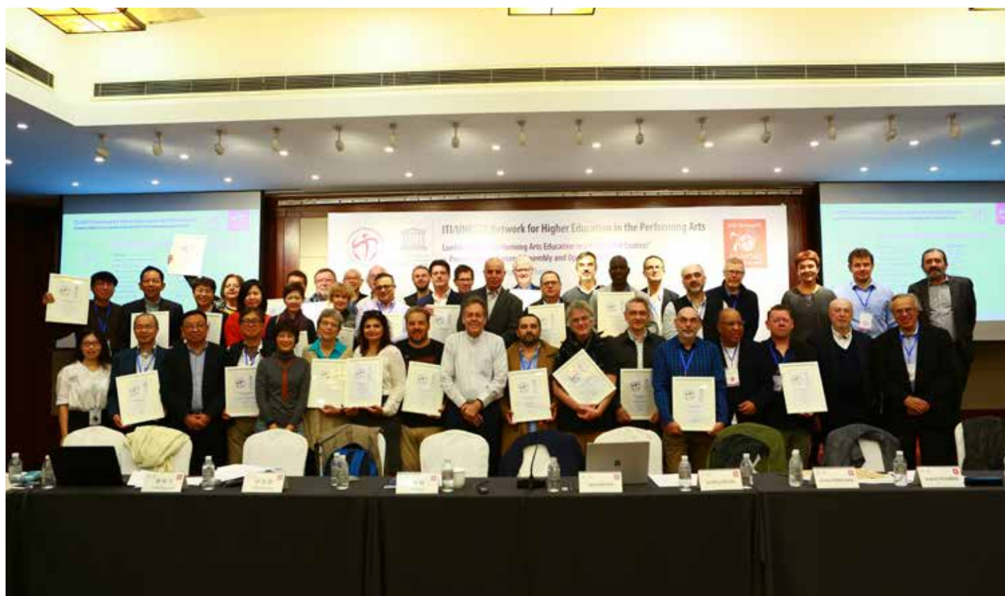
The existing and new members of the ITI/UNESCO Network with guests and organizers

[For more info: 2 nd General Assembly Minutes – Attachment: minutes of Second General Assembly Network Shanghai, 22 October 2018]