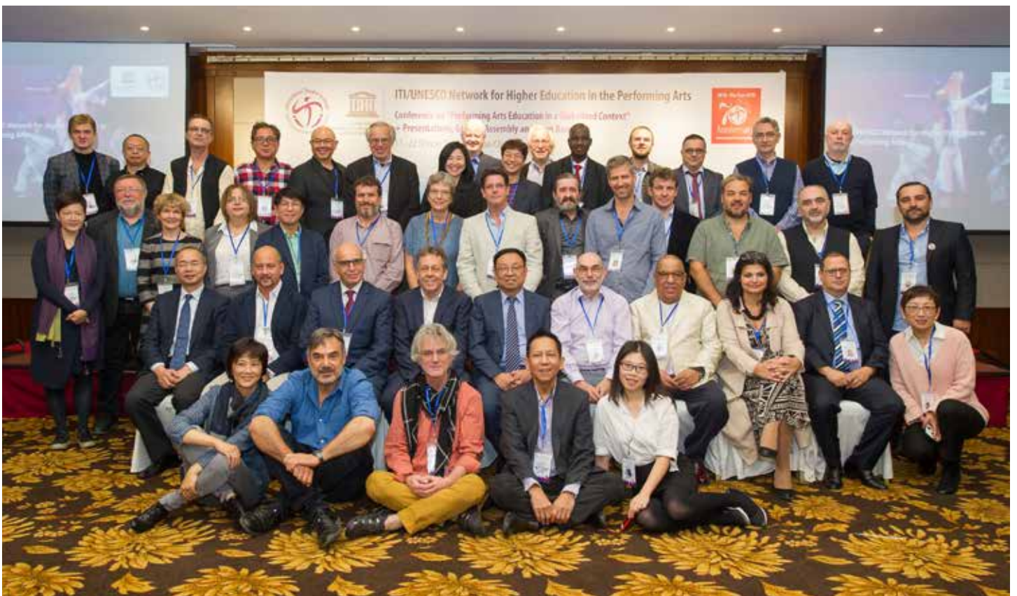
The participants of the Conference and Open Assembly (extended General Assembly with the new Members)